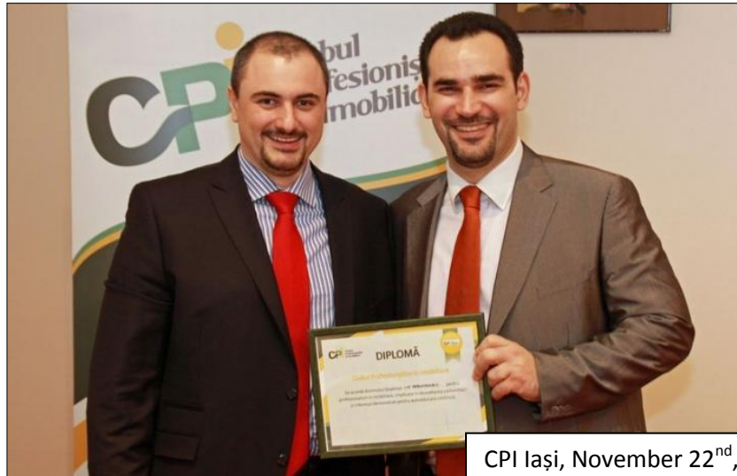
CPI Iași, November 22 nd , 2011