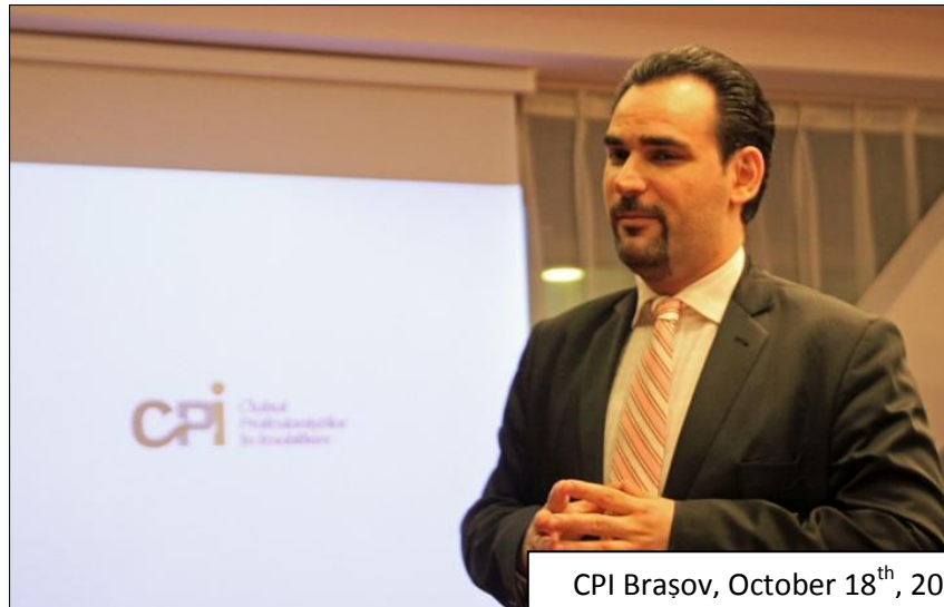
CPI Brașov, October 18 th , 2011