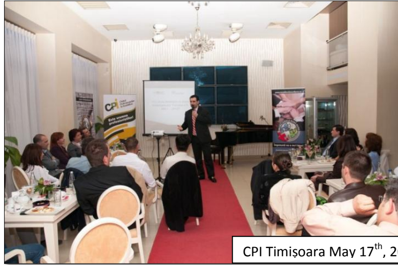
CPI Timișoara May 17 th , 2011